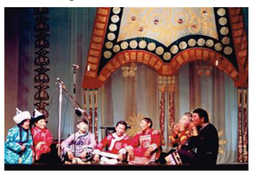
Fig. 1. Ensemble from the Tyva Republic on stage. 1991, Yakutsk. Рис. 1. Ансамбль из Тувы на сцене. Якутск, 1991 г.

When I got acquainted personally with them during the conference, they taught me how to pull out the whistle-like overtone melody from a fundamental tone. Especially, Gennadii Chash<sup>1</sup> from Shagonaar (Ulug-Khem district) became my first